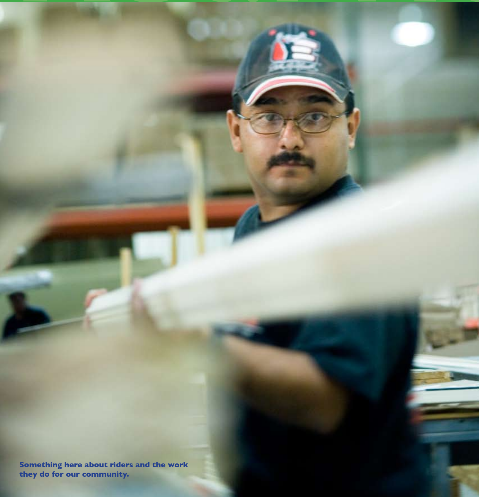
Something here about riders and the work they do for our community.

JULY 2005 – MV Transportation Awarded Service Contract The City of Holland awarded a $4.8 million three-year contract to MV Transportation to assume daily operations of the bus service after a competitive bid process. MV worked closely with MAX staff to ensure a seamless transition between service providers.